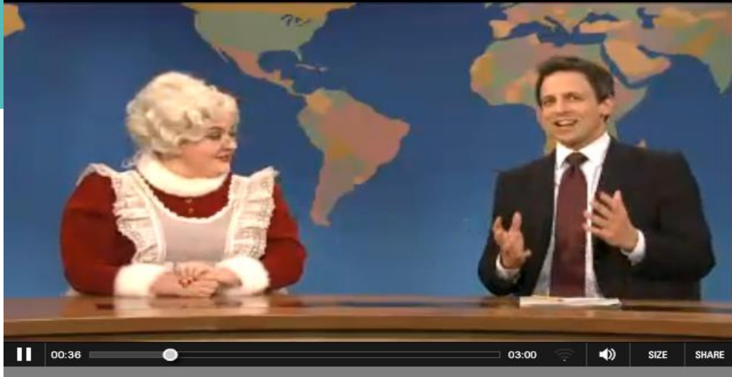
Weekend Update: Mrs. Claus

SM: You must be excited to see him when he comes back?